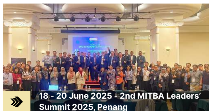
» 18 - 20 June 2025 - 2nd MITBA Leaders' Summit 2025, Penang

As part of MITBA's continued effort to channel the proceeds from its Charity Movie initiative toward meaningful community outreach, we extended support to Rumah Kasih, Setapak - an old folks home dedicated to providing care, shelter, and dignity to its residents. The contribution included funds to support the home's ongoing needs, essential groceries to help ease their monthly provisions, and a KFC lunch prepared for the residents, adding a warm moment of comfort and enjoyment to their day.