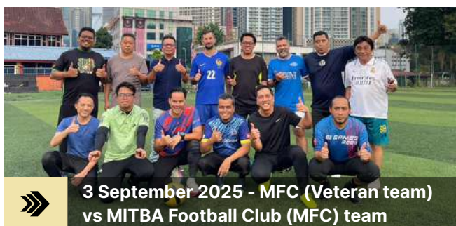
» 3 September 2025 - MFC (Veteran team) vs MITBA Football Club (MFC) team