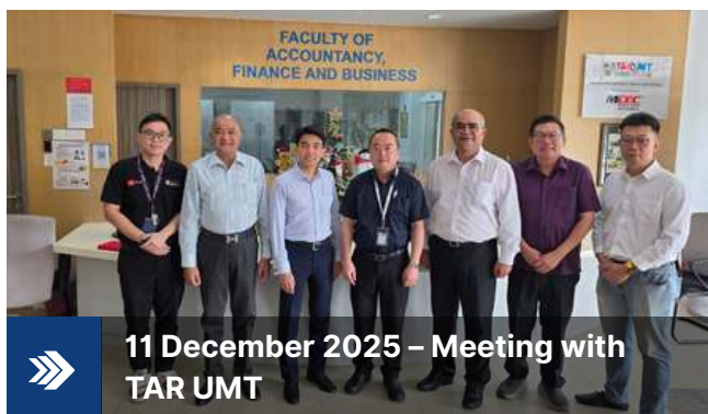
11 December 2025 – Meeting with TAR UMT

A productive pre-training meeting was held with ANZIIF and the appointed speaker in preparation for the upcoming webinar on "EV Insurance: International Practices for New Energy Vehicles" scheduled for 11 November 2025. The session focused on content alignment, delivery structure, and addressing emerging trends in electric vehicles and mobility insurance. MITBA anticipates an engaging and insightful session that will equip members and industry peers with international best practices, regulatory guidance, and risk considerations. This initiative highlights MITBA's commitment to continuous professional development and ensuring members remain informed on evolving insurance and new energy vehicle markets.