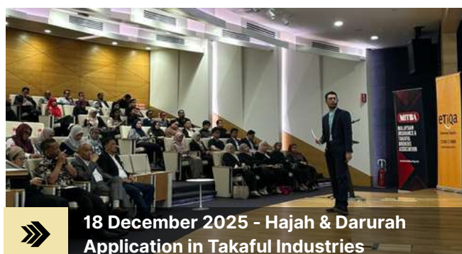
» 18 December 2025 - Hajah & Darurah Application in Takaful Industries

MITBA conducted the morning session of the Hajah & Darurah Application in Takaful Industries, a focused knowledge-sharing programme designed to deepen industry understanding of Shariah-based principles in takaful operations. The session provided insights into the application of Hajah and Darurah within contemporary takaful practices, addressing real-world operational challenges faced by brokers. Participants gained greater clarity on regulatory expectations, ethical considerations, and frameworks relevant to takaful transactions. MITBA extends its appreciation to Bank Negara Malaysia for its presence and support, and to Etiqa General Takaful Berhad and Etiqa Family Takaful Berhad for organising and delivering this tailored programme for MITBA members.