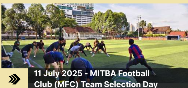
» 11 July 2025 - MITBA Football Club (MFC) Team Selection Day

Beyond structured dialogues, the Summit provided meaningful opportunities for networking and collaboration, encouraging members to exchange ideas and explore joint initiatives for future growth. MITBA remains committed to championing thought leadership, fostering unity within the broking fraternity, and advocating for a resilient, progressive ecosystem that continues to serve the nation's insurance and takaful brokers industry with professionalism and integrity.