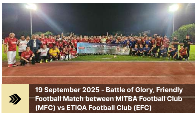
19 September 2025 - Battle of Glory, Friendly Football Match between MITBA Football Club (MFC) vs ETIQA Football Club (EFC)