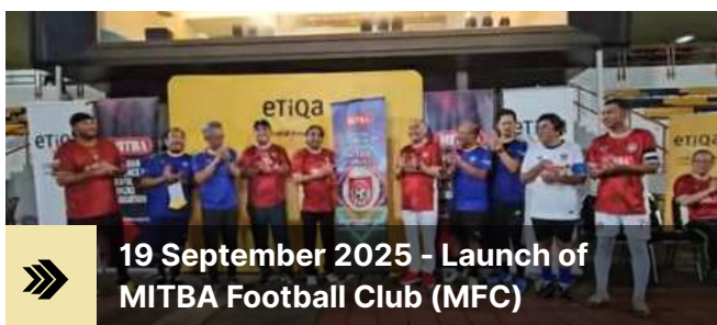
19 September 2025 - Launch of MITBA Football Club (MFC)

The meeting also included the election of the new Board of Directors for 2025–2027, ushering in a leadership team poised to advance MITBA’s mission with fresh ideas, experience, and commitment. Congratulations to all newly elected Board members, whose vision and guidance will continue to strengthen professional standards, promote industry excellence, and foster collaboration across the broking community.