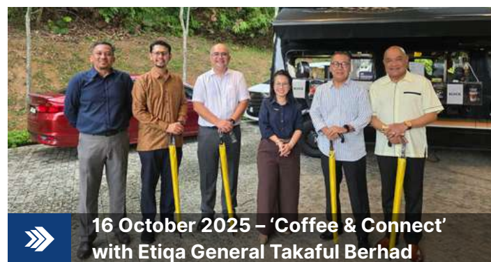
16 October 2025 - 'Coffee & Connect' with Etika General Takaful Berhad