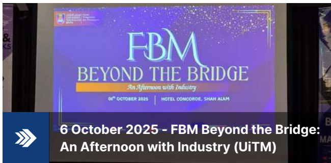
6 October 2025 - FBM Beyond the Bridge: An Afternoon with Industry (UiTM)