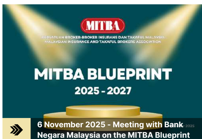
» 6 November 2025 - Meeting with Bank Negara Malaysia on the MITBA Blueprint

The MFC continued its active football calendar with a friendly match against Anggun HUKM Football Club. The match provided a platform for members to build fitness, teamwork, and sporting excellence. The friendly match was an exciting display of skill, teamwork, and camaraderie, ending with a 9-4 victory for the combined MFC and MFC Veterans team. Through regular training sessions and friendly matches, MFC continues to promote active lifestyles, build connections among members and highlight the importance of mentorship, collaboration, and the shared joy of sport, reflecting MITBA's ongoing commitment to fostering teamwork beyond the professional sphere.