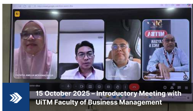
15 October 2025 - Introductory Meeting with UiTM Faculty of Business Management