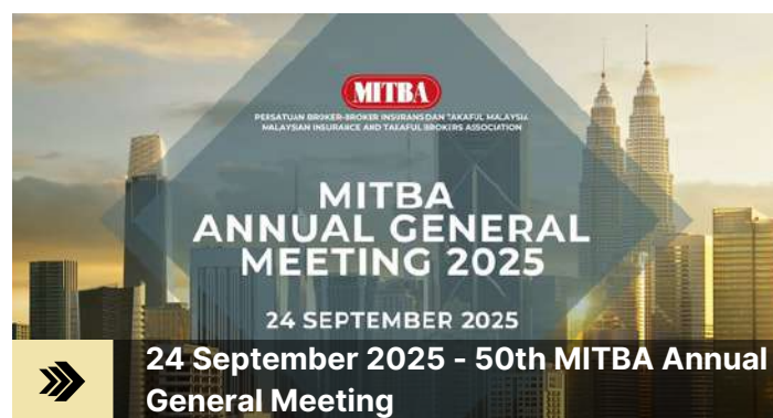
24 September 2025 - 50th MITBA Annual General Meeting

The much-anticipated “Battle of Glory” friendly match brought together MITBA FC and ETIQA FC for an unforgettable evening of football, camaraderie, and celebration. The atmosphere was electric as both teams prepared to showcase their skill, teamwork, and passion for the game. Before kickoff, the two teams exchanged flags, symbolising that tonight’s match was about unity, collaboration, and the shared love of football - not just the scoreline. Veterans from both sides stepped onto the field, blending experience with youthful energy and proving that the spirit of football knows no age. The match itself was a nail-biting contest, filled with skillful play, determination, and moments of high tension. After a fiercely fought game, MFC emerged victorious with a 4-2 win on penalties. Yet the evening was about more than the final score, it was a celebration of grit, teamwork, and the joy of football.