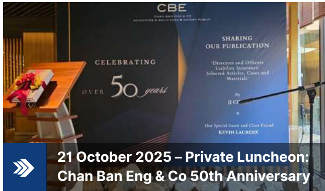
21 October 2025 – Private Luncheon: Chan Ban Eng & Co 50th Anniversary