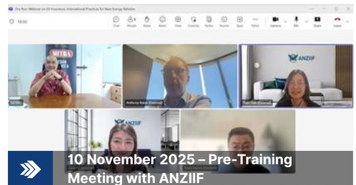
10 November 2025 – Pre-Training Meeting with ANZIIF