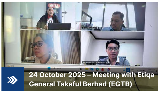
24 October 2025 – Meeting with Etiqa General Takaful Berhad (EGTB)