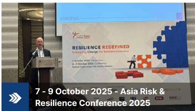
7 - 9 October 2025 - Asia Risk & Resilience Conference 2025