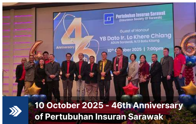
10 October 2025 - 46th Anniversary of Pertubuhan Insuran Sarawak