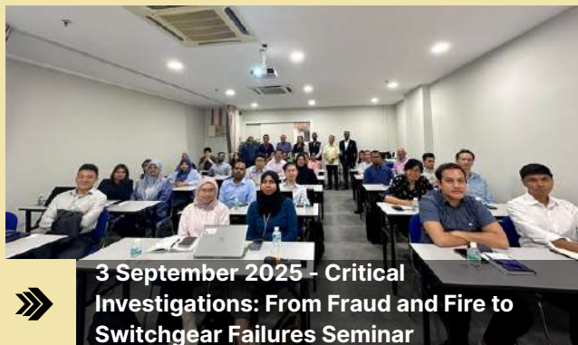
3 September 2025 - Critical Investigations: From Fraud and Fire to Switchgear Failures Seminar