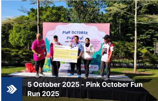
5 October 2025 - Pink October Fun Run 2025