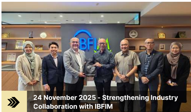
» 24 November 2025 - Strengthening Industry Collaboration with IBFIM