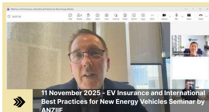
» 11 November 2025 - EV Insurance and International Best Practices for New Energy Vehicles Seminar by ANZIIF