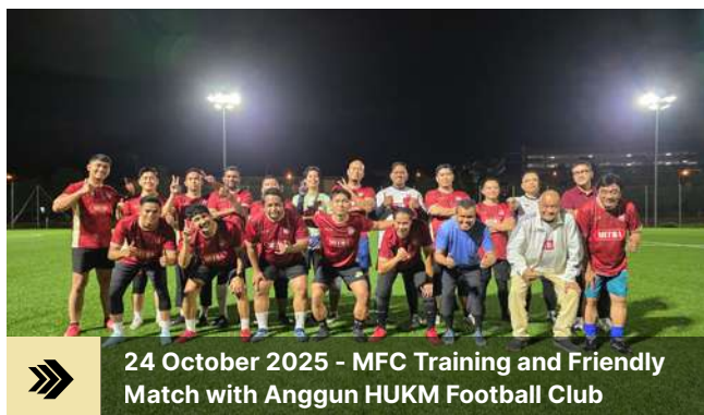
» 24 October 2025 - MFC Training and Friendly Match with Anggun HUKM Football Club

The MFC continued its active football calendar with a friendly match against Anggun HUKM Football Club. The match provided a platform for members to build fitness, teamwork, and sporting excellence. The friendly match was an exciting display of skill, teamwork, and camaraderie, ending with a 9-4 victory for the combined MFC and MFC Veterans team. Through regular training sessions and friendly matches, MFC continues to promote active lifestyles, build connections among members and highlight the importance of mentorship, collaboration, and the shared joy of sport, reflecting MITBA's ongoing commitment to fostering teamwork beyond the professional sphere.