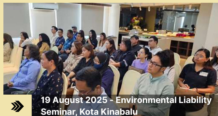
» 19 August 2025 - Environmental Liability Seminar, Kota Kinabalu

MITBA hosted the annual Brokers' Cocktail 2025 at the Majestic Hotel Kuala Lumpur, bringing together professionals from across the insurance and takaful broking industry. The event provided a relaxed yet purposeful setting for members, partners, and stakeholders to strengthen relationships and explore potential areas of collaboration. Conversations throughout the evening reflected shared aspirations for industry growth, professionalism, and cohesion, reaffirming MITBA's ongoing commitment to fostering unity and meaningful engagement within the broking fraternity. The gathering also offered members the opportunity to exchange ideas on market developments, celebrate collective achievements, and reinforce the strong sense of community that continues to drive the industry forward.