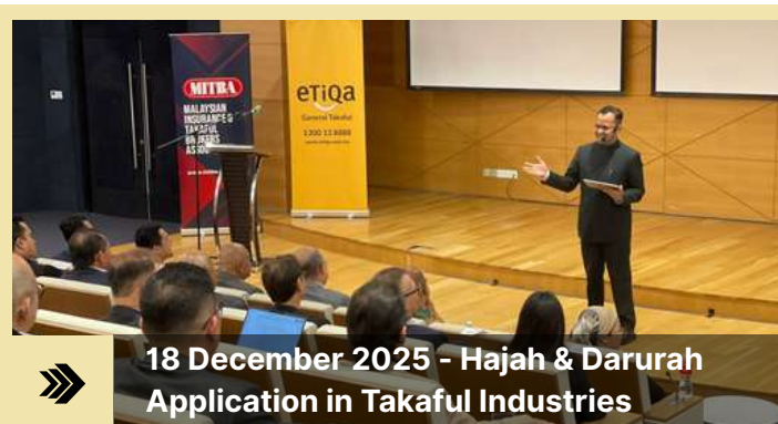
» 18 December 2025 - Hajah & Darurah Application in Takaful Industries

MITBA recently convened the Ngopi Ngopi session, a focused engagement designed to bring members together in an open and constructive setting. The session provided a practical platform for CEOs, CFOs, and COOs to gain clarity on SST & E-Invoicing, while also delving into the MITBA Blueprint. This format encouraged a more natural flow of ideas, enabling participants to align on priorities and reflect on the broader direction of the broking community. As MITBA continues to strengthen member engagement, these sessions will remain an important avenue for industry dialogue, collective preparation, and shared insight.