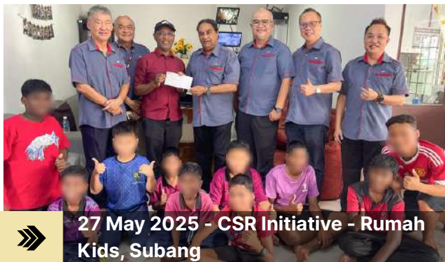
» 27 May 2025 - CSR Initiative - Rumah Kids, Subang

We extended our support to Rumah Kids, Subang, through the proceeds raised from our recent Charity Movie initiative. This contribution enabled us to provide a warm lunch for the children, along with funds that support their essential needs, daily living costs and overall well-being. During the visit, the MITBA team spent time engaging with the children and learning more about the home's ongoing programmes, which focus on education, emotional development, and creating a safe, nurturing environment for every child under their care. The interaction offered valuable insight into the challenges faced by the home and reinforced the importance of sustained community support.