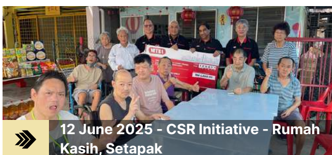
» 12 June 2025 - CSR Initiative - Rumah Kasih, Setapak

We extended our support to Rumah Kids, Subang, through the proceeds raised from our recent Charity Movie initiative. This contribution enabled us to provide a warm lunch for the children, along with funds that support their essential needs, daily living costs and overall well-being. During the visit, the MITBA team spent time engaging with the children and learning more about the home's ongoing programmes, which focus on education, emotional development, and creating a safe, nurturing environment for every child under their care. The interaction offered valuable insight into the challenges faced by the home and reinforced the importance of sustained community support.